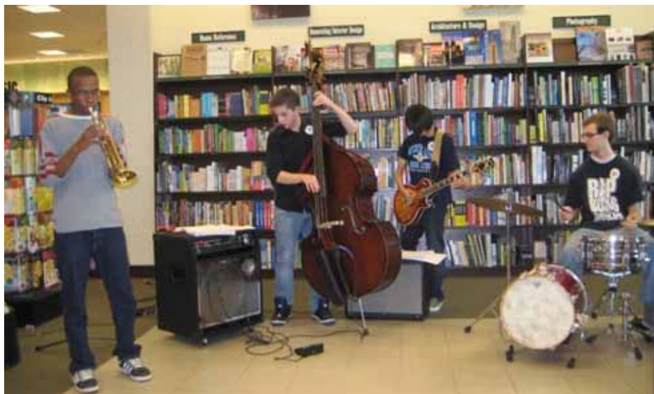
Get your groove on...The East High jazz band wowed customers while they shopped.

We raised $534.06 for new materials, and actually had a donation of 21 books that were on the WPL's Wish List. The donated books' value was $232.08 for a total of $768.14. We had lots of fun, and it took very little work on our part besides the scheduling of the program. Giving credit where credit is due, Lea Barnhardt with the Foundation, did a huge amount of the work for us. She is the staff person with the Foundation.